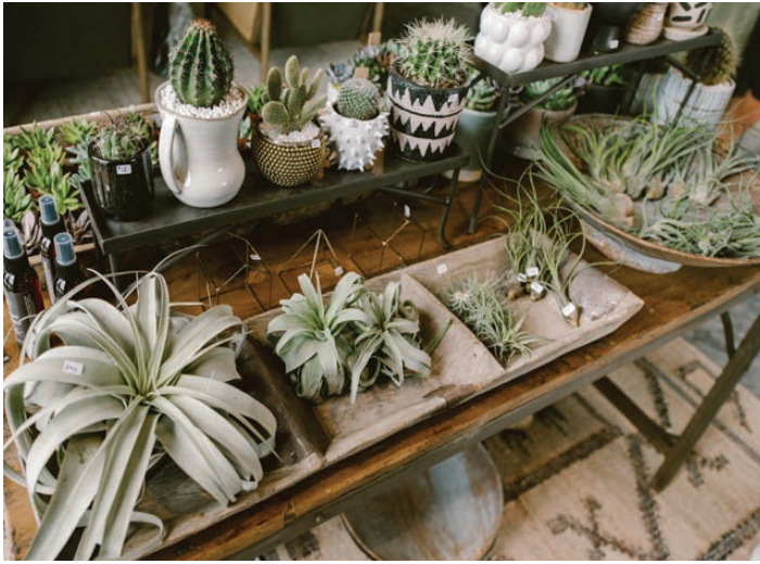
Succulents, the superstars of the plant world, can be arranged by The Coastal Succulent into beautiful, affordable housewarming and office gifts.

has provided table arrangements for the Girls Leadership Academy of Wilmington (GLOW) fundraisers and for Welcome Home Angel, Power of the Purse and Pink Ribbon Project.