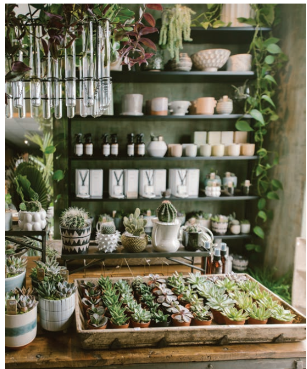
Choose from a wide array of succulents for The Coastal Succulent to customize for your home.

Starting out small, they sold potted live succulent arrangements and terrariums. They went on to develop a wholesale division to supply Whole Foods Market stores in the southeast. That grew into offering creative potting workshops and plant maintenance services and then expanded to include full custom designs for both residential and commercial spaces. Now, The Coastal Succulent offers succulent and floral options for events including decor installations and table runners. The Coastal Succulent